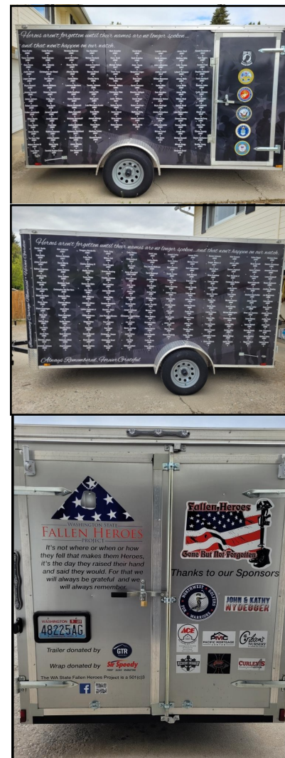
The new Fallen Heroes Memorial float

While we were waiting for the parade to start, I happened to notice a group across the park that had several Hispanic dancers dressed in brightly colored native costumes and wearing carved wooden masks practicing their routine. I was making my way over to