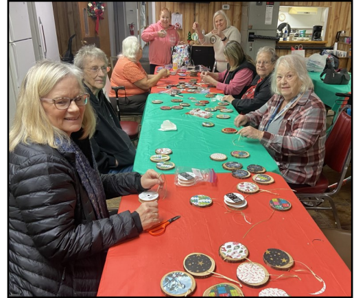
Auxiliary members making holiday crafts at the Post.