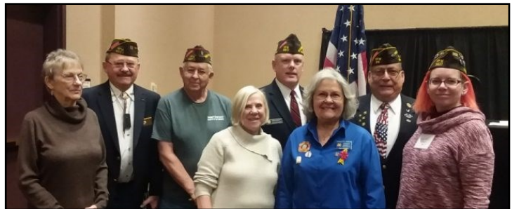
Post and Auxiliary members from District 7 at the Mid-winter conference in 2020.

Saturday is the primary Business day of the convention. Post and Auxiliary will have a shared opening in the morning, including comments from Commander and President as well as presenting any Department level awards. After a break, the Post and Auxiliary will break into their separate business sessions where department-level program chairpersons will give a short brief on the status of their programs and progress made at the midpoint of the 2023-2024 VFW year. Typically business is concluded by about 3pm, giving us time for networking before the Banquet.