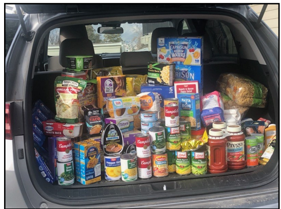
Donations received and delivered to Serve Wenatchee.

The Auxiliary has been busy these last few months. We completed our food drive for Serve Wenatchee, delivering a car load of food and toiletries to them. A special thank you to everyone who donated to our now-annual event that helps our community in the "off season". This year our Community Outreach project was to help collect used durable medical equipment (DME) for KC Help. If you are not familiar with this organization, they collect, refurbish if needed, and provide items to community members for free. On March 23rd we held a drive to collect DME for KC Help, and we collected a variety of items including a wheel chair, canes, crutches, knee braces, and more.