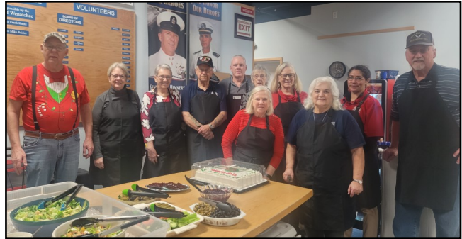
Post and Auxiliary member volunteers at the ANG Holiday Party

On Dec 7th, we hosted their unit Holiday Party at the Wenatchee Veteran's Hall. We provided a classic turkey and ham dinner with all the fixings. They had about 75 members attending including a few of their family members. A special thanks to our members that really stepped up and did all the cooking and logistics to make this an outstanding event.