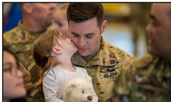
Army National Guardsman gets a kiss from a loved one.

Wear purple this April to show your support. This color was chosen as it represents unity among all branches by blending blue (Air Force, Navy), green (Army), and red (Marines).